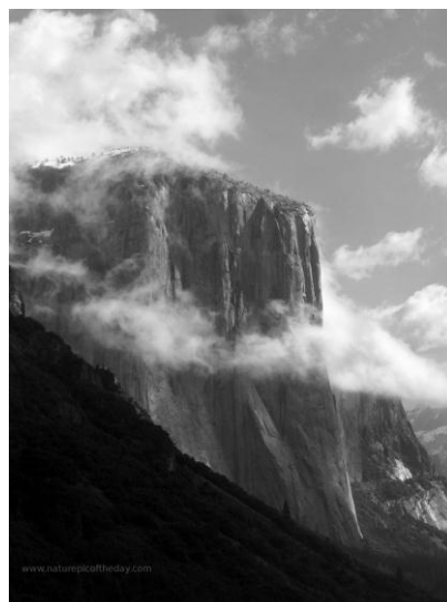
Looks like fun!