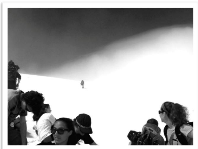
Climbing Mount Saint Helens.