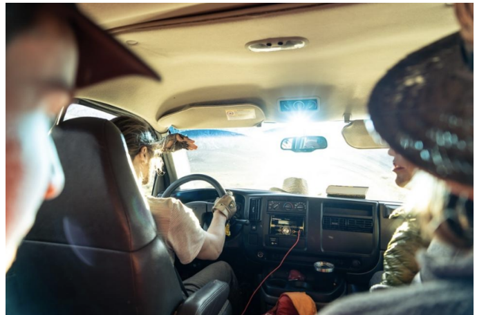
AN ABSOLUTELY EPIC MARTY MOBILE MOMENT