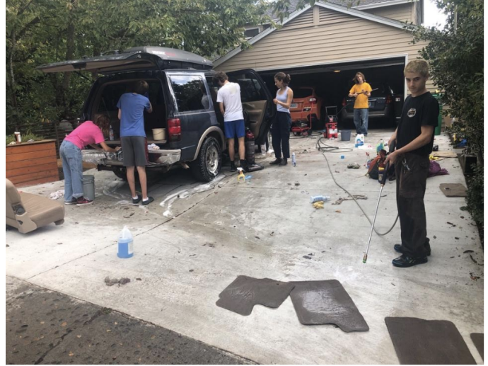
MARTY MOBILE GETS A CLEAN!

This month we say goodbye to our long time friend, the "Marty Mobile". Over the past few years, this profound vehicle has not only carried Post members and gear, but the memories that go along with the amazing experiences we have with this organization. The "Marty Mobile" will be greatly missed and will forever stay dear in our hearts. Below are some pictures of the irreplaceable moments that Post 58 members have shared with Marty. The good news is that the Marty Mobile is in great shape, and will be sold on the open market - because the Post has been donated a newer van! If your parents want you to have a BIG and safe car to drive around in, with good tires, a new radiator and lots of room, than tell them about the availability of this workhorse.