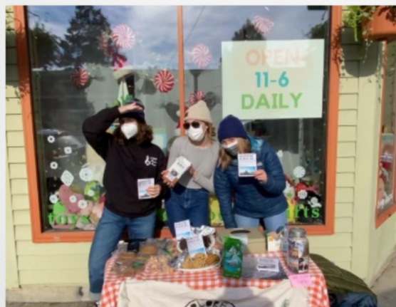
First Equity Team Bake Sale! 11/21/21